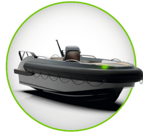
000 CC LINE